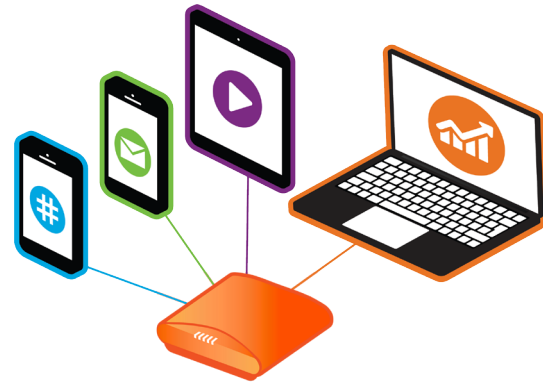
High performing, easy to manage and affordable Wi-Fi

With 802.11ac Ruckus Unleashed access points (AP), users can take advantage of higher speeds, better coverage, and improved reliability. Unleashed APs include key Ruckus technologies, such as BeamFlex+ adaptive antenna Technology to maximize signal coverage, throughput, and network capacity, and ChannelFly Technology, our predictive capacity management for RF channel selection. And Zero-IT enables easy device onboarding with several key guest features, such as guest WLAN access, captive portal, Guest Pass, and Custom Logo, to provide key value add services to users.