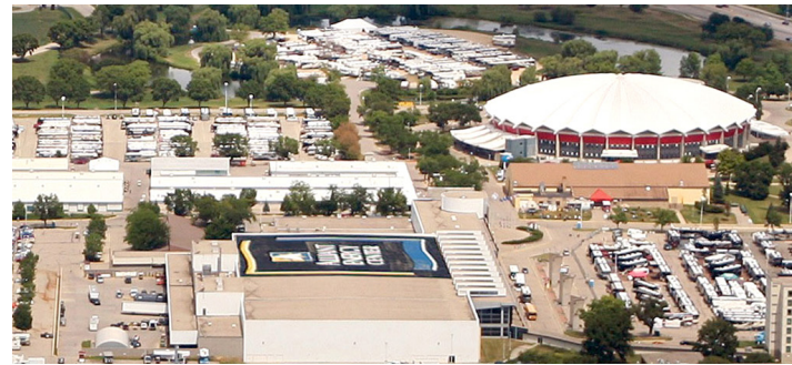
ABOVE: The Alliant Energy Center complex, one of the premiere conference centers in the midwest, spans 164 acres and needed to upgrade its Wi-Fi infrastructure to support large-scale events attracting huge numbers of delegates, visitors and vendors, all demanding fast and reliable wireless connectivity.

The World Dairy Expo created some unique RF challenges, as thousands of animals were constantly moving around within a massive facility constructed of RF unfriendly materials. This created potential havoc for the propagation of RF transmissions.