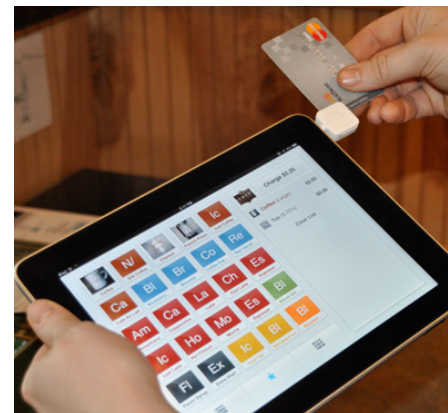
ABOVE: AEC used Smart Wi-Fi to deliver reliable wireless connectivity for point of sale applications at the World Dairy Expo.

Having passed the high client density requirements faced during The World Dairy Expo, AEC is now looking to expand its new Ruckus Smart Wi-Fi infrastructure within its exhibition hall and the 10,000-seat Veterans Memorial Coliseum and views reliable Wi-Fi services as a revenue generating services it can now confidently offer it’s customers and visitors.